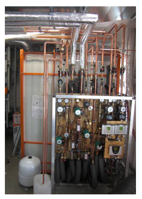
Figure 4. The production hall with a large PV-collector field as well as 30 m<sup>2</sup> of solar thermal collectors (left) and the prototype of the charge and discharge unit in the boiler room (right)