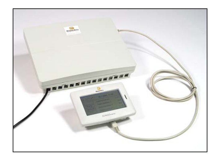
Figure 5. The new developed universal controller, consisting of the hardware unit (top) and the control unit with touchscreen (bottom)

Due to the complexity of the control processes, special attention has been paid to the development of a simple and self-explaining user interface. This is achieved by the use of a touchscreen, a structured menu navigation and a plain text display. A control unit with a graphics capable display can be installed in the living space. The modular approach is also considered for the controller: depending on the complexity of the system it is possible to connect up to 3 hardware units for the connection of sensors and actors. The model in Figure 2 is equipped with 2 units.