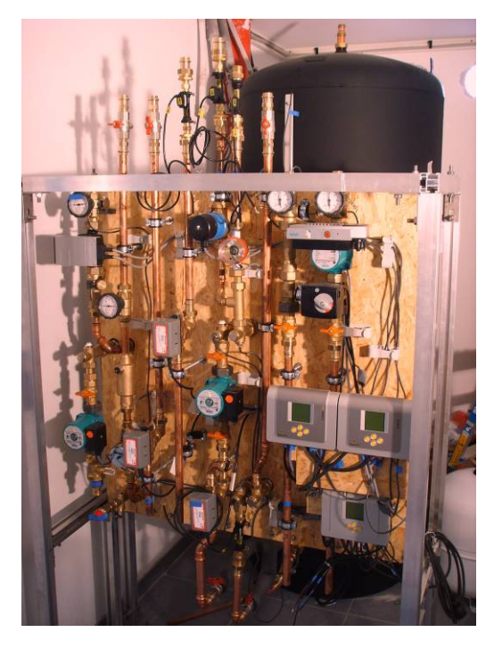
Figure 3. The single-family house with 16.8 m<sup>2</sup> of façade-integrated collectors (left) and the prototype of the charge and discharge unit in the basement (right) during installation.

The second field test is conducted in the new-built and energy self-sufficient production hall of the partner company Wagner & Co. Solartechnik (see Figure 4, left). The space heating demand for 5.000 \text{ m}^2 of production area and an adjacent office building is covered by a woodchip boiler of 350 kW rated power. There is an additional hot water demand of up to 1.000 l/day due to several showers and washstands. The space heating demand for the office building of about 15 kW as well as the hot water demand is partly covered by the solar thermal system. The collector has an aperture area of 30 \text{ m}^2 . Other than at the first field test, a non-pressurized store is installed. This is a prototype of the store concept that is developed within the frame of another research project (Wilhelms, 2009). The store has a volume of 5 \text{ m}^3 and is connected to a prototype of the charge and discharge unit in its largest expansion (i.e. with a heat exchanger in each loop for the integration of the non-pressurized store and two heating loops, see Figure 4, right).