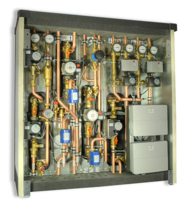
Figure 2. Exhibition model of the charge and discharge unit (without front cover)